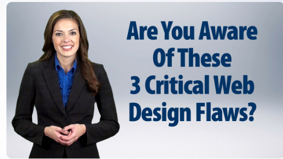
This is the EXACT SAME video hosted on our website with a customized thumbnail. (Yes, it has rounded corners on the video.)

At InnovaMax Marketing, we host our client's videos for them and triple encode all of our videos for our clients so that they play back seamlessly in HD (high definition), SD (standard definition), and on mobile devices without forcing visitors to leave the page. And yes, they work perfectly on iPads and iPhones, everytime—even when streaming over cellular networks. Additionally, we always custom create a video thumbnail so that visitors to your website will want to push play and actually watch your video.