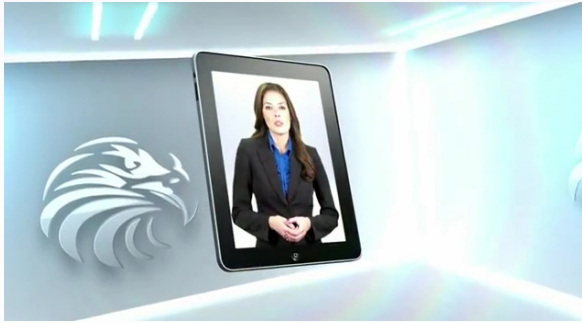
This is the actual thumbnail for one of our videos on YouTube (the thumbnail is generated by YouTube).

our website. Which one would you be more inclined to click and watch?